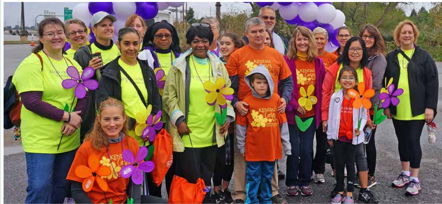
Staff across the system participate in public awareness events such as the Walk to End Alzheimer's.

For everyone, it's about doing something worth doing, feeling good about oneself and helping to improve the lives of others in the process.